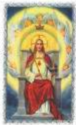
Christ, our King